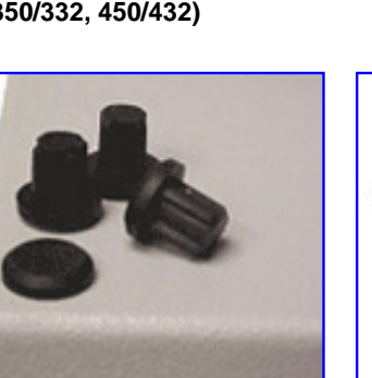
Non-Skid Feet (P/N 50) RETURN TO TOP